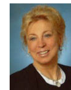
York. (Additional Office: Mineola, NY)