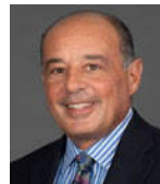
District Courts for the Western and Eastern Districts of Pennsylvania and the Southern District of West Virginia. (Additional Office: Pittsburgh, PA)